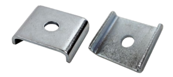
STRUT SADDLE WASHER