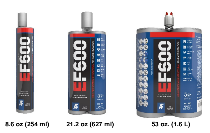
FIGURE 2—EF600 ADHESIVE ANCHORING SYSTEM AVAILABLE PACKAGING OPTIONS