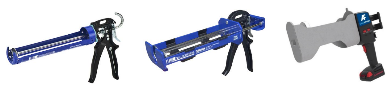
FIGURE 4— EF600 ADHESIVE DISPENSING EQUIPMENT