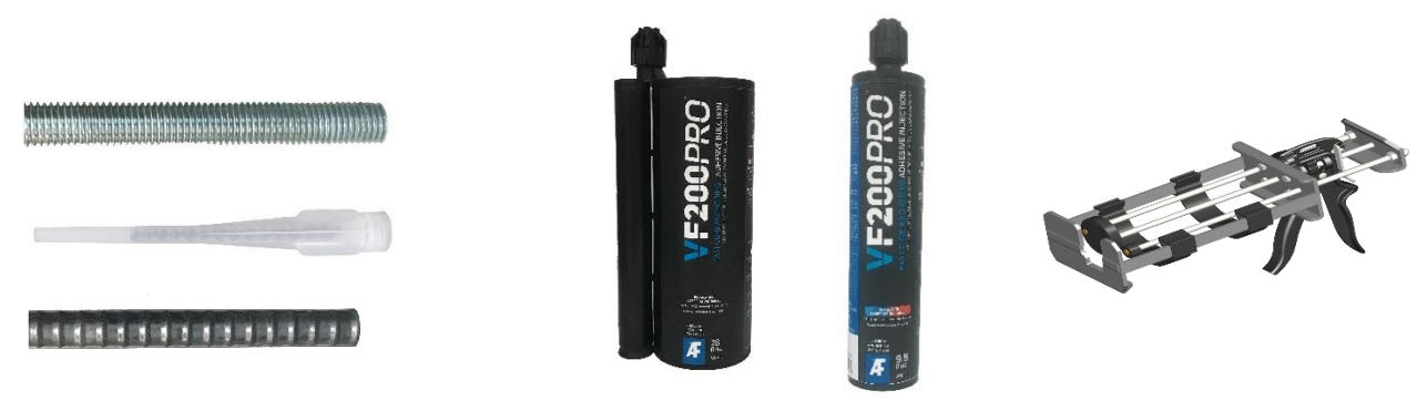
FIGURE 1—VF200PRO ADHESIVE ANCHORING SYSTEM AND TYPICAL ANCHOR ELEMENTS